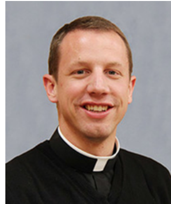
Parochial Vicar from 07/01/2021 to 07/01/2022 Currently at Church of Saint Anne, Bismarck

IN HONOR OF THE 50TH ANNIVERSARY OF QUEEN OF PEACE, PAST PARISH HAPPENINGS WILL BE HIGHLIGHTED PERIODICALLY.